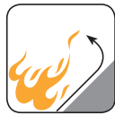
Fire Retardant NF C32-070-2.2(C1) IEC 60332-3/EN 50266