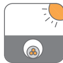
Laid In conduit