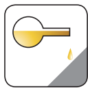
Mineral Oil Resistant