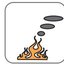
Low Corrosivity EN 50267-2-2/NF C32-074 IEC 60754-2/NF C20-453