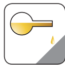
Acid & Alkaline Resistant