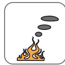
Low Smoke Emission IEC 61034/NFC20-902 EN 50268/NF C32-073