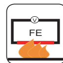
Insulation Integrity FE180 EN 50200/IEC 60331 /NF C32-070-2.3(CR1)